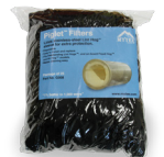
Pack of 25 Piglet™ Filters